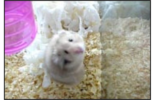
One of the residents of the Bilbao Zoo, Ratonito Dormilon, mugs for the camera in her new multilevel home. The zoo caretaker indicates she regularly sleeps in the tubes connecting the levels.

The smallest tank, 10 gallons, is occupied by two large angels who constantly harass the other residents, enough to scare them completely out of the tank.